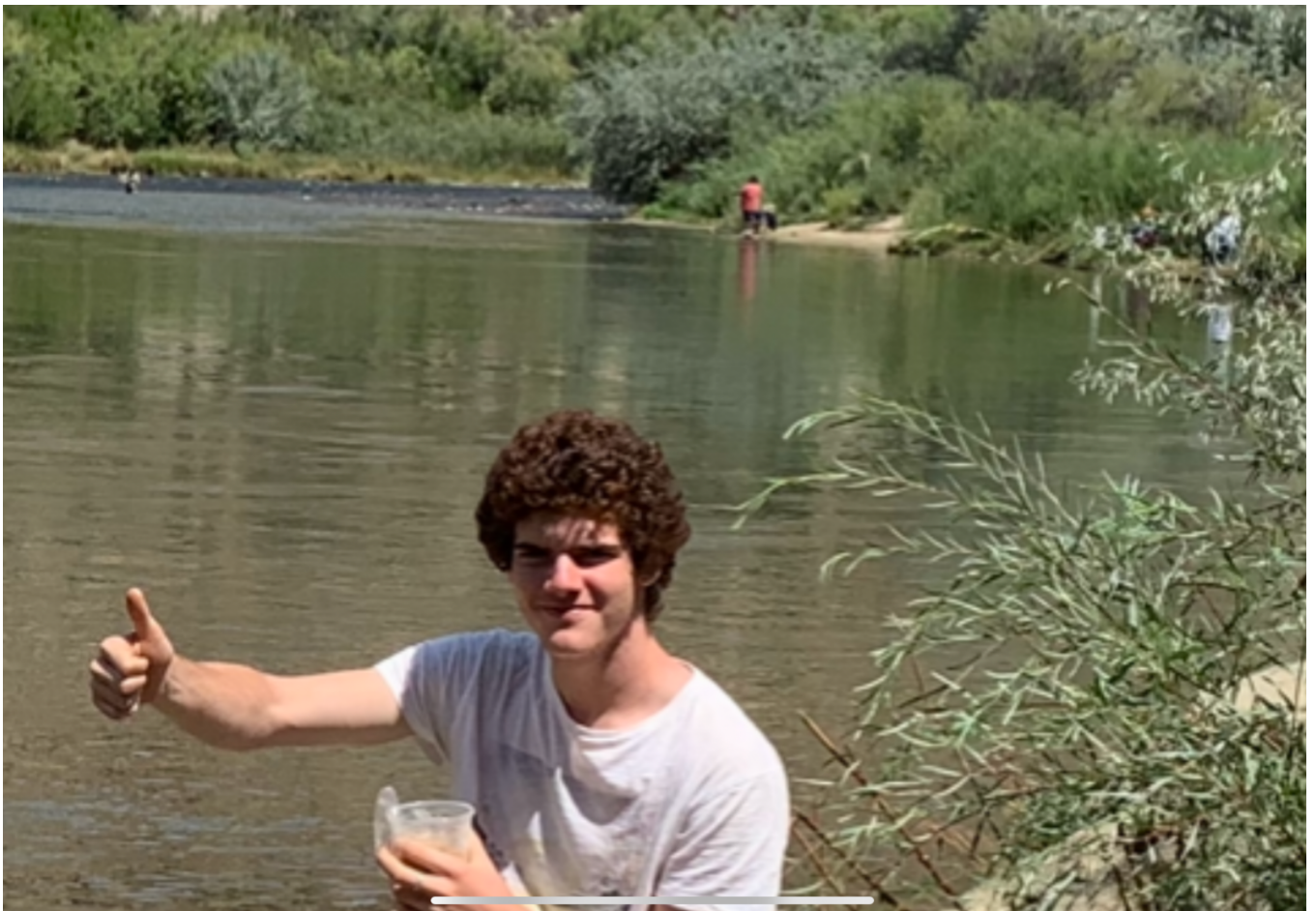
Above Photo: Student Enjoying Navajo Dam Tour